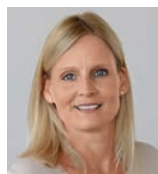
Britta Castañeda Street

Please talk to us to put together a bespoke service package.